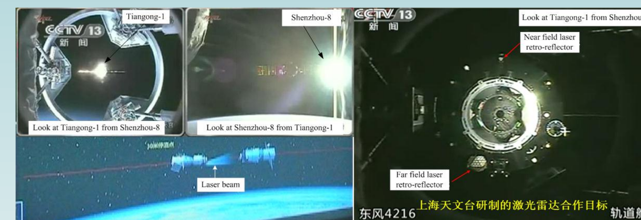
Fig.5 The docking between TG-1 and SZ-8

After meeting docking mission requirements and passes all of space environmental simulation checks, the laser retro-reflectors were installed on the surface of TG-1 spacecraft launched on 09/29/2011. The SZ-8 spacecraft carrying lidar measuring system was launched on November 1, 2011. At the local time of 1h43min on November 3, the two spacecrafts, TG-1 and SZ-8, successfully realized the first unmanned automatically rendezvous and docking. Fig.5 and Fig.6 show the scenes of rendezvous and docking between TG-1 and SZ-8 from CCTV screen.