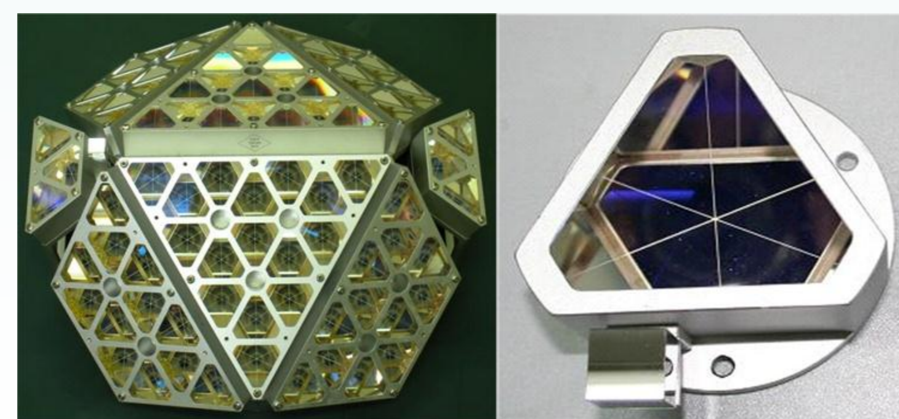
Fig.4 The photo of laser retro-reflector in lidar measuring system

For assessing whether the designed reflector could meet the requirements of TG-1 docking mission, we calculated the effective reflective area of the far field laser retro-reflector (Fig.3) relation to the azimuth and elevation under the coordinate and the origin fixed at the reflector (X axis directs the spacecraft moving direction). For the far field laser reflector, the main characteristics are following: 1) the effective reflective area over 180cm 2 when the azimuth and elevation are \pm 30 deg and -25 \sim 70 deg respectively; 2) the effective reflective area over 100cm 2 when the azimuth and elevation are \pm 45 deg and -25 \sim 70 deg respectively; 3) the total of weight is about 8.6kg. For the near field laser retro-reflector, the effective reflective area was over 15cm 2 with the weight of about 0.18 kg. Fig. 4 shows the photos of laser retro-reflector installed on TG-1 spacecraft.